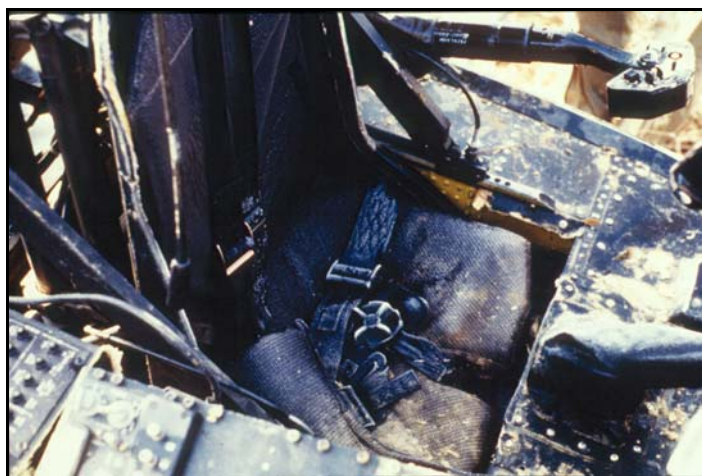
Figure 3. This seat stroked approximately 35.6 cm in a crash of a UH-60 with an estimated vertical impact velocity of 15.2 m/s. The pilot received no spinal injury.