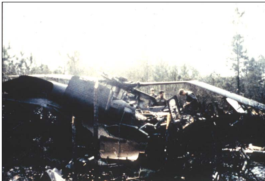
Figure 1. A crash of a UH-60 where the roof completely collapsed, crushing the two rear occupants.

The container must also be designed to prevent penetration of external objects into occupied spaces. Another issue related to the container is high mass item retention. Transmissions, rotor systems, and engines should have sufficient tie-down strength to ensure that they do not break away and enter occupied spaces in survivable crashes. Finally, the belly and the nose of the helicopter should possess sufficient structural strength and be shaped so as to prevent plowing or scooping of earth during crashes with significant longitudinal velocity since plowing decreases stopping distances and results in higher decelerative loads. In general, cockpit/cabin designs should allow for no more than 15 percent dynamic deformation when subjected to the design crash pulse.