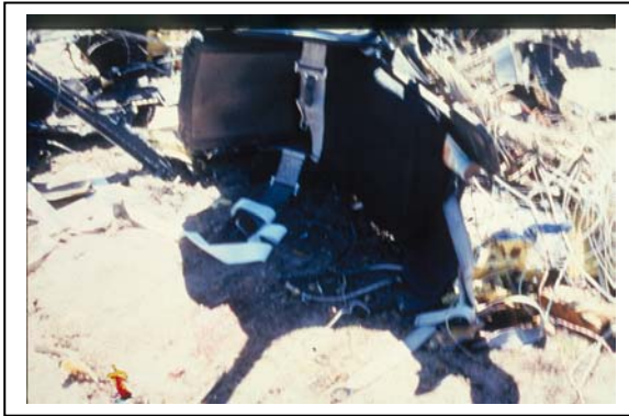
Figure 2. This seat became dislodged from its attachments with the pilot still strapped into it during the crash. His injuries were largely due his ejection during the crash.