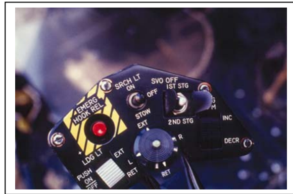
Figure 7. Note how the switch guard and landing light adjustment switch correspond to the injuries of the pilot.

It is important to evaluate the local environment of occupants during the design phase of an aircraft since many potentially hazardous objects may be placed outside of the strike zone if they are recognized early in the design phase as hazards. In many cases placing hazardous objects outside of the strike zone is no more difficult or expensive than placing them within the strike zone. It is simply a matter of recognizing the hazard. Potentially injurious objects that cannot be relocated can be designed to be less hazardous, padded, or made frangible.