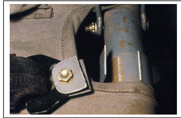
Figure 3. The occupant of this seat was ejected when his lap belt detached from the seat.

In small aircraft with confined interiors (most helicopters), both lap belt and upper torso restraint are essential for crash survivability of crew and passengers. Not only does upper torso restraint reduce upper body flailing and contact with interior structures, but it also provides for greater distribution of acceleration loads across the body. A tie-down strap (crotch strap) incorporated into the restraint system helps reduce the potential for “submarining”. Submarining occurs when the lap belt rides up above the bony structure of the pelvis and compresses the soft organs of the abdomen. This frequently results in serious abdominal injury or spinal distraction fractures. Many so called “seat belt injuries” can be attributed to this mechanism. As an adjunct to standard belt type restraint systems, the U.S. Army is currently developing multi-bag, airbag systems for use in some of its helicopters (Alem et al., 1991). As in the automobile, these systems have tremendous potential for reducing the incidence of flailing injuries and should be economically adaptable to civil applications.