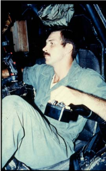
Figure 5. The proximity of the cyclic and collective controls is aggravated by the stroking of the seats in the UH-60 as demonstrated by this subject in a seat stroked by a crash.

about 50 percent when upper torso restraint is utilized. Clearly, the primary concern must be for hazards within the strike zone of the head and upper torso, but objects within the strike zone of the extremities also should be considered.