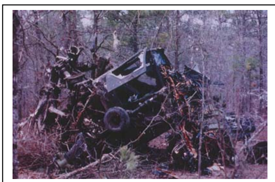
Figure 8. This is a severe crash of an AH-64. The fuel tank was ripped from the helicopter and found some distance from the wreckage.

In the case of postcrash fire, controlling the hazard at the source has proven to be an extremely effective strategy for helicopters (Figures 8 and 9). Since the U.S. Army introduced crash resistant fuel systems (CRFS) into its helicopter fleet in the 1970's up to approximately 1997, there has only been one fire related death in a survivable crash (Shanahan and Shanahan, 1989b; Singley, 1981). Prior to the introduction of CRFS, up to 42 percent of deaths in survivable crashes of U.S. Army helicopters were attributed to fire (Haley, 1971; Singley, 1981). Considering the magnitude of the problem of postcrash fire in non-CRFS equipped helicopters and the incredible effectiveness of CRFS, it is most regrettable that helicopters continue to be produced without crash resistant fuel systems. This situation continues more because of the persistent failure of regulatory agencies to require CRFS use than that of the manufacturers to provide them. Indeed, many manufacturers have offered CRFS as an option, but few operators have opted to pay the additional cost, trusting instead that their helicopter will not be involved in a crash. Fortunately, significant progress now is being made in the regulatory arena. The U.S. Federal Aviation Administration has required CRFS fuel tanks in all newly certified helicopters since 1990, and at least one airframe manufacturer has incorporated CRFS into all airframes constructed since about 1982.