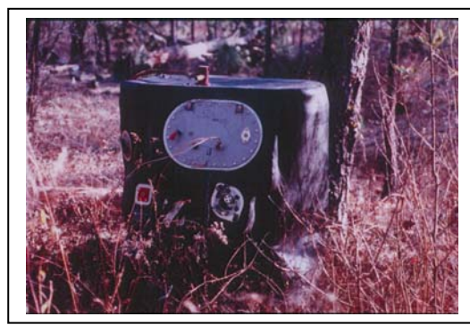
Figure 9. Missing fuel cell from AH-64 shown in figure 8. The cell was found full without any evidence of leakage.

Other strategies employed to prevent the consequences of fire and fumes are to use fire retardant and low toxicity materials in the construction of aircraft and to provide physical separation of flammable materials from ignition sources and occupied areas.